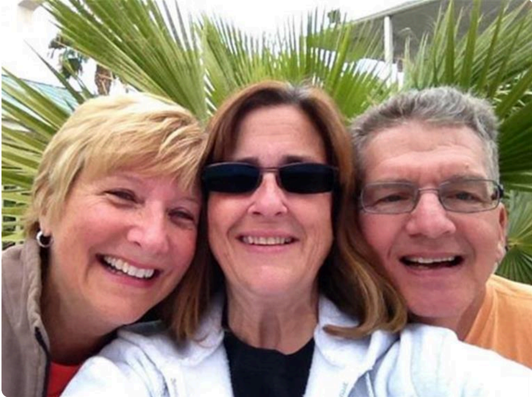
Fun time in Las Vegas 2011